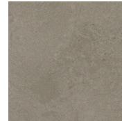
832 River Rock